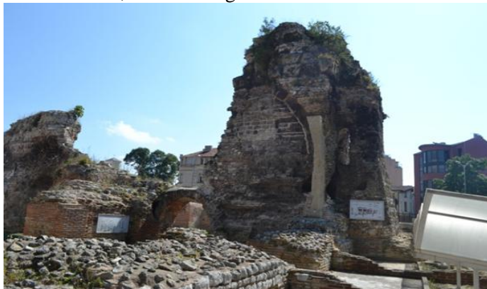
Photo 1. The ruins of the Roman thermae in Varna.

Right at the entrance gate, there is a plaque depicting the thermae 's history. There are also bath architectural plans on the walls. In addition, each bathing chamber has its individual name written on a board.