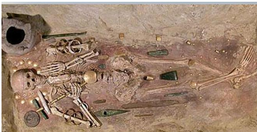
Photo 2. One of the graves restored in the Archaeological Museum.