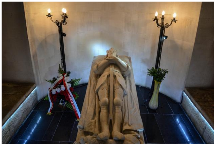
Photo 4. The sarcophagus of Wladyslaw of Varna Mausoleum.

was placed on the other side of the burial mound where the Mausoleum of Wladyslaw III of Varna was built. The tombstone was brought there on shoulders, in a festive procession. The main alley leads to the museum pavilion, which stores pieces of exhibitions.