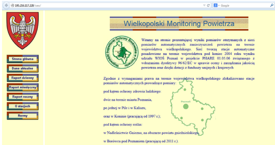
Figure 2. Main website of the Wielkopolska voivodship inspectorate for environmental protection

inspectories. Websites of a few inspectorates (Małopolskie, Wielkopolskie, Lubuskie and Opole) are based on the same pattern (Fig. 2-3).