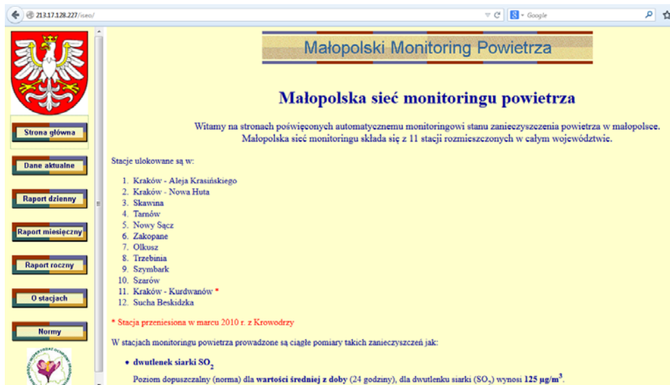
Figure 3. Main website of the Małopolska voivodship inspectorate for environmental protection

The choice of stations for which the user may view the results is made in one of the two ways: from a map or from a list. The latter is used by inspectorates in Małopolska, Wielkopolska, Łódź, Opole and Silesia. Other inspectorates use a map for this purpose. A more interactive version employs Google maps (Masovia, Pomerania, Lower Silesia