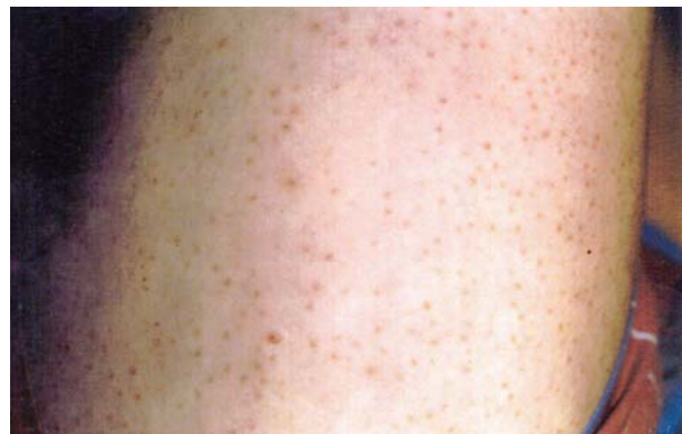
Figure 1. Disseminated follicular, slightly keratotic papules, pin- or match-head sized, on the extensor surface of the arms

Karyotype: in 11 examined metaphases, 46 XY karyotype was found, without fragile chromosomal sites.