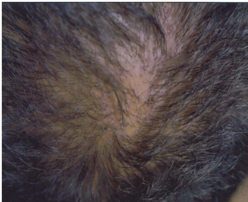
Figure 5. Follicle-based erythematous papules in the parietal capillitium, with scalp showing atrophy and patchy alopecia

same process (ie. KPA), and that by distribution of changes, severity of inflammation, and the degree of atrophy, they can be classified into one of three existing groups: 1) keratosis pilaris atrophicans faciei (KPAF); 2) atrophoderma vermiculatum (AV); and 3) keratosis follicularis spinulosa decalvans (KFSD) (7). Moreover, AV (synonyms: atrophoderma reticulatum; folliculitis erythematosa reticulata; English - honeycomb atrophy; French - Acne vermoulant) is characterized by symmetrical, preauricular small follicular erythematous papules which are quickly followed by atrophic scars and small, pit-like, atrophic areas, irregular in shape and bounded by narrow ridges, giving the cheeks a worm-eaten appearance and may represent an end stage of the preceding two diseases. Another group of authors argues that the KPAF, KFSD, AV and folliculitis spinulosa decalvans (FAD), described by Van Ouch in 1992 (8), are four clearly distinct clinical entities characterized by the presence of keratosis pilaris atrophicans (2, 9). Thus, atrophoderma vermiculatum, as a clearly distinct clinical and pathomorphological entity, may be associated with various syndromes and multiple anomalies, reviewed by Schaller and associates (10).