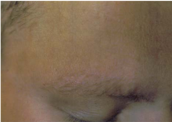
Figure 4. Lateral eyebrow loss, the eyelashes completely spared

final phase of the follicular destruction; it is supposed that unknown etiological factors lead to release of cytokines from follicular keratinocytes, which then induce hyperkeratosis and inflammatory changes (2, 6).