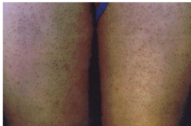
Figure 2. Disseminated follicular, slightly keratotic papules, pin- or match-head sized, on the extensor surface of the arms