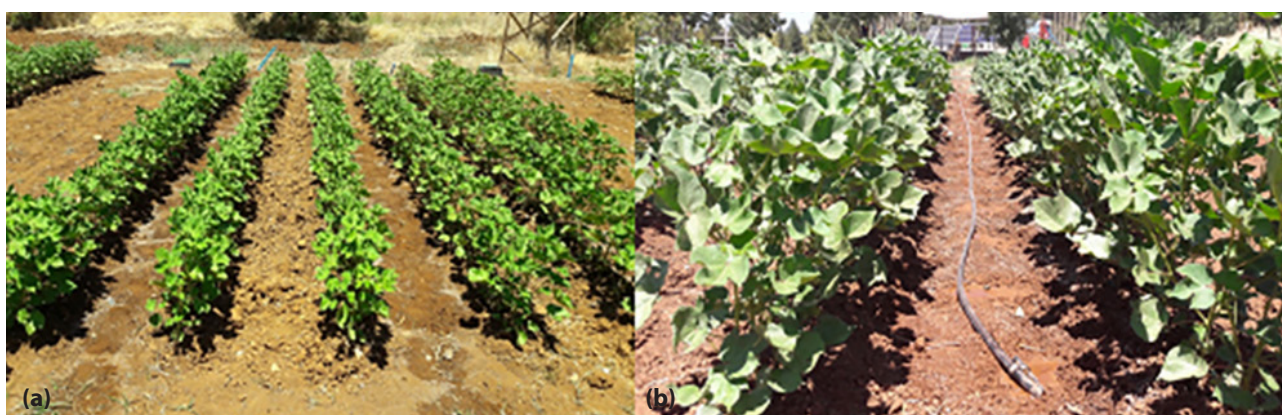
Figure 3 Use of subsurface (a) and surface drip (b) drip irrigation on field crops such as cotton Source: Çetin et al., 2018

experiences required for its design, install, operation and management.