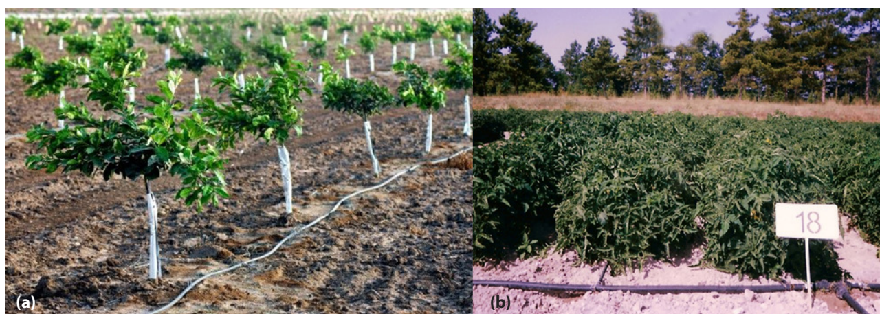
Figure 1 Use of drip irrigation for different horticultural crops. Young orange trees (a), field tomatoes (b) Source: (a) – anonymous, 2019b; (b) – Çetin and Uygan, 2008

water use by 30% to 70% and raises crop yields by 20% to 90% depending on soil, climatic and crop characteristics, and farmers practices if it is properly designed, installed and operated (Postel et al., 2001; Çetin and Bilgel, 2002). In addition, considering water savings and higher yields by drip irrigation, water use efficiency also increases at least by 50% (Chartzoulakis and Bertaki, 2015).