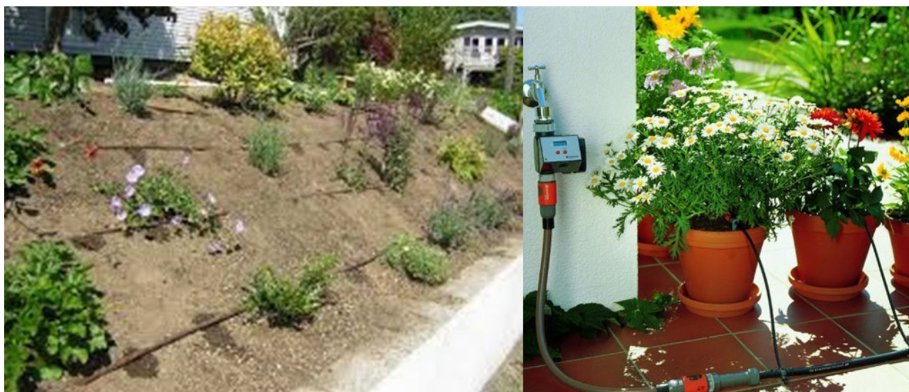
Figure 2 Use of drip irrigation for ornamental plants