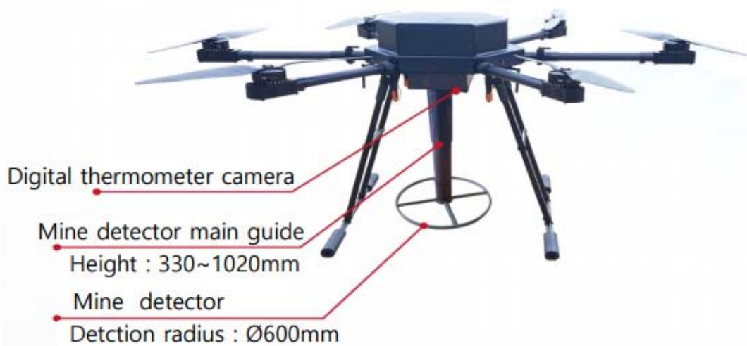
Figure no. 3: Hexacopter with a metal detector and IR camera

We can observe a metal detector as the most common equipment for mine searching combined with an infrared (IR) camera installed on a 6-rotor drone (Figure no. 3). During the search drone follows the terrain, continuously moves 10 centimeters from surface.