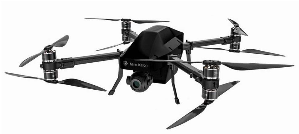
Figure no. 4: Quadrokopter with double rotors and an optical camera