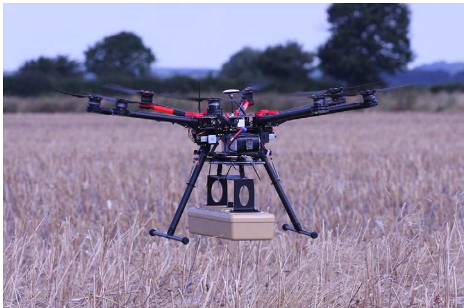
Figure no. 5: Octocopter with a GPR

scan the ground in different depth. The weight of drone is between 14.1-14.8 kg depends on the GPR type, the flying time between 15-20 minutes, flying speed 2 m/sec.