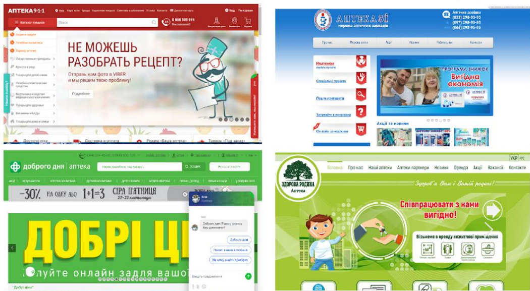
Figure 3 - Main pages of Ukrainian pharmacies' websites (examples)

For further comparative evaluation, it is necessary to first build numerical evaluations of the sites under consideration, according to the selected parameters.